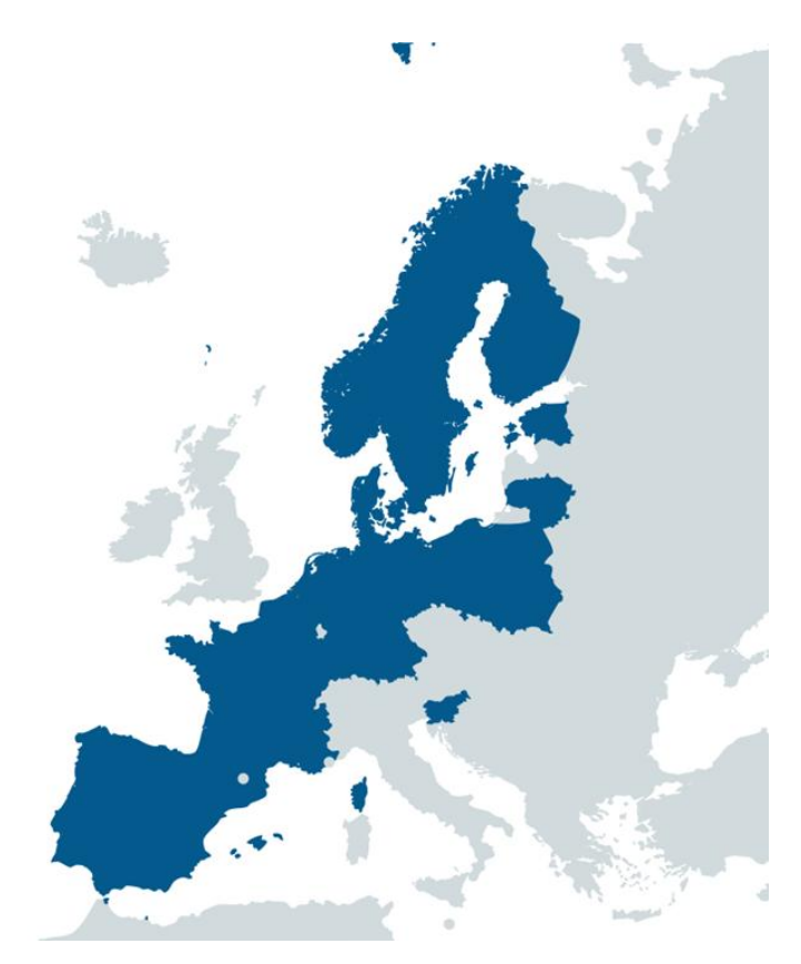
27 partners – 14 countries